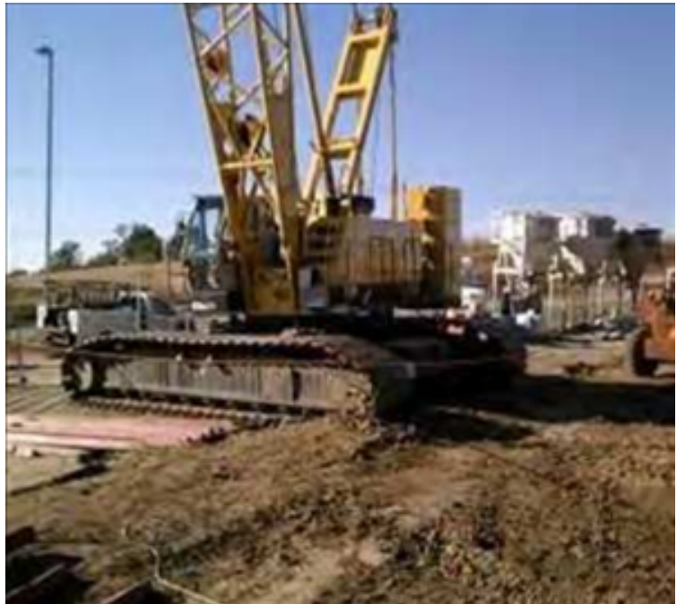
Radius guard should be flagged to help increase visibility