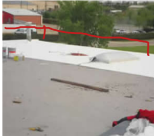
Need warning lines installed in area marked in red