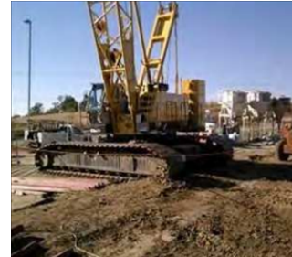
This crane has radius guard, but it should be flagged