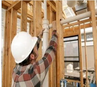
Contractor not wearing safety glasses