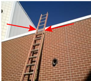
Ladder not secured