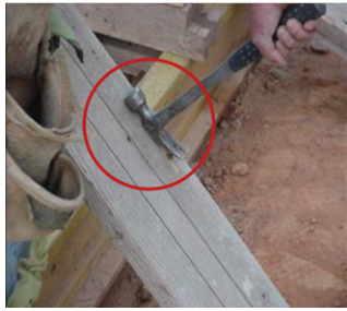
Nails were removed or bent down on several boards of scrap lumber