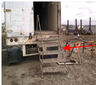
Electrical Contractor Trailer