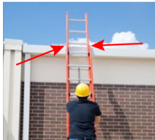
Ladder needs to be tied off

Issue Identified Handrails are not provided as required on stairs with 4 or more risers (1926.1052)