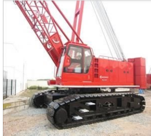
Radius guard is missing on this crane