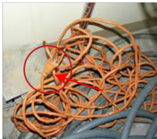
This cord was removed from service

Issue Identified Electrical cords are not adequately protected or kept clear of working spaces and walkways (1926.416)