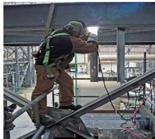
Consider alternative tie-off method (i.e. retractable to limit fall distance)

Issue Identified Control lines are not erected at least 6 back feet from all unprotected/leading edges when erecting precast concrete members (1926.502)