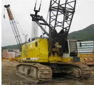
Radius guard is missing