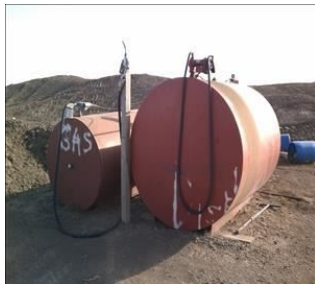
Fuel tanks are not properly labeled