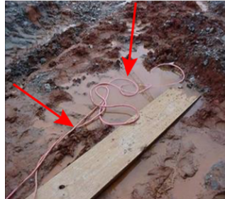
Flexible cord near job trailer should be relocated